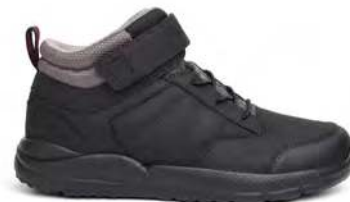
Trail Boot Oil Black