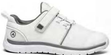
Sport Jogger White/Grey