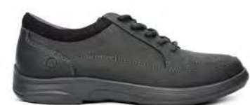
Casual Sport Oil Black