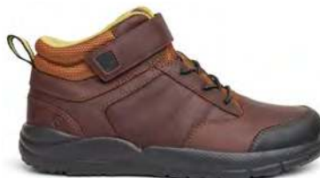
Trail Boot Whiskey