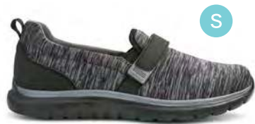
Sport Trainer Black/Grey