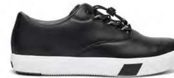
Casual Sneaker Black