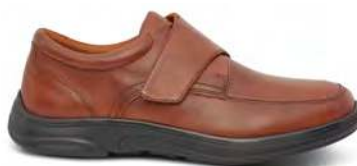
Casual Oxford Burnished Brown