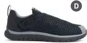
Sport Double-Depth Stretch Black