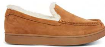
Moc Toe Camel