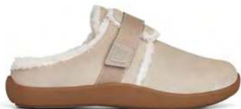
Open Back Sand