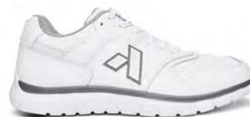
Sport Trainer White