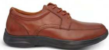
Casual Oxford Burnished Brown