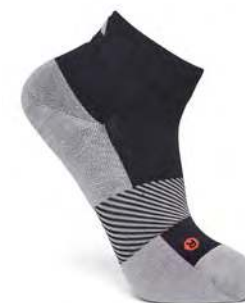
Quarter Length Black