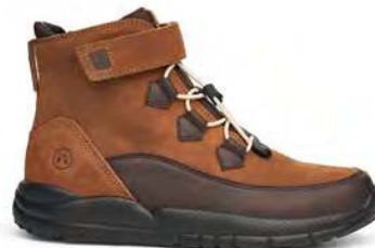
Trail Hiker Almond