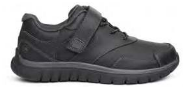
Sport Walker Black