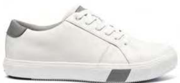
Casual Sneaker White