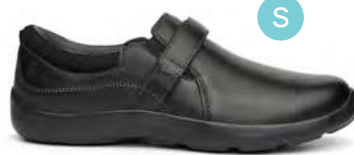
Casual Dress Black