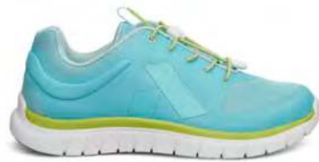
Sport Runner Teal/Lime