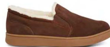
Smooth Toe Espresso