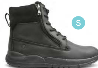
Trail Worker Oil Black