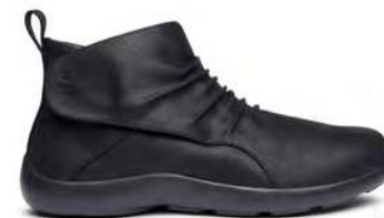
Casual Boot Black