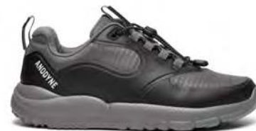
Trail Runner Black