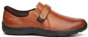
Casual Dress Cognac