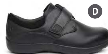
Casual Double Depth Black Stretch