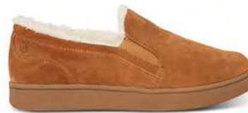
Smooth Toe Camel