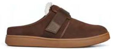
Open Back Espresso