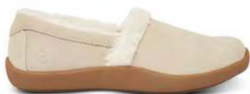
Smooth Toe Sand