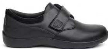
Casual Comfort Stretch Black Stretch