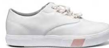
Casual Sneaker White