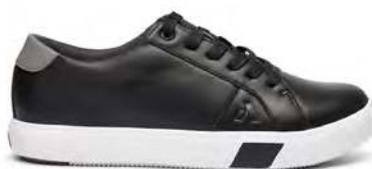
Casual Sneaker Black