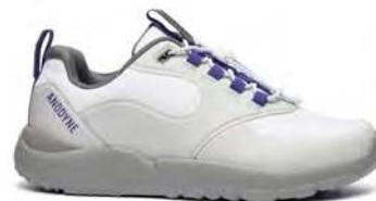
Trail Runner White