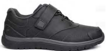
Sport Walker Black