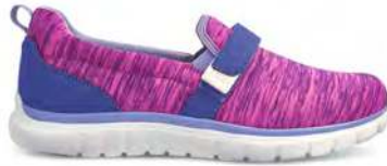
Sport Trainer Purple/Pink