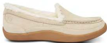
Moc Toe Sand