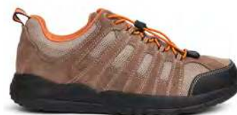
Trail Walker Stone