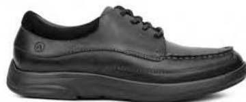
Casual Dress Black