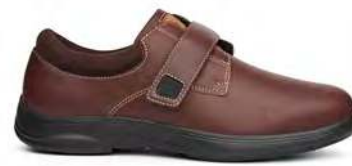
Casual Comfort Whiskey