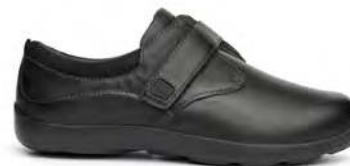
Casual Comfort Black