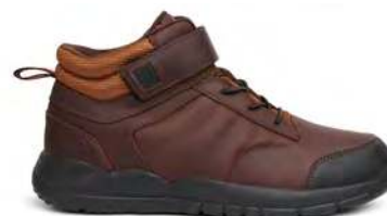
Trail Boot Whiskey