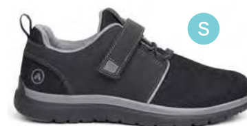
Sport Jogger Black/Grey