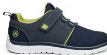
Sport Jogger Blue/Green