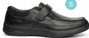
Casual Dress Black