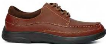
Casual Dress Whiskey