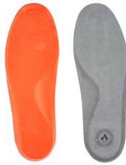
Gel-Foam Hybrid Inserts