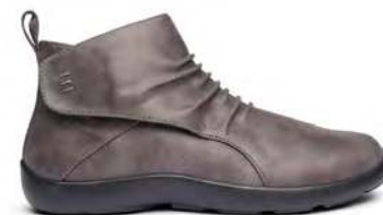
Casual Boot Grey