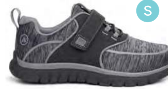
Sport Jogger Black/Grey