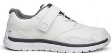
Sport Walker White