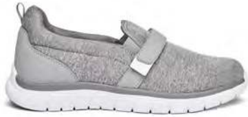
Sport Trainer Grey