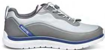
Sport Sprinter Grey