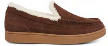
Moc Toe Espresso