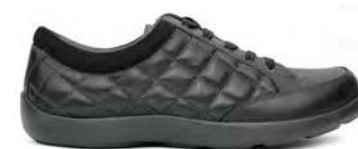
Casual Sport Black