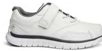
Sport Walker White