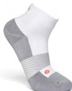
Quarter Length White