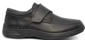
Casual Oxford Black