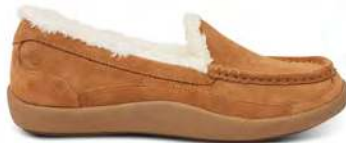
Moc Toe Camel