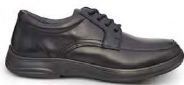
Casual Oxford Black