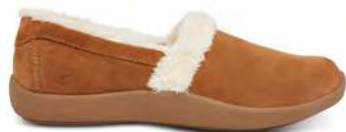
Smooth Toe Camel