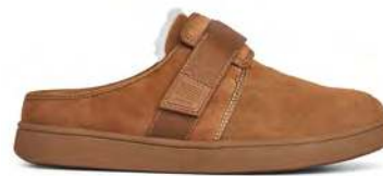
Open Back Camel