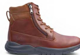
Trail Worker Whiskey