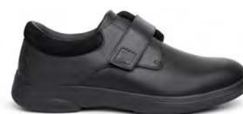
Casual Comfort Stretch Black Stretch