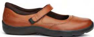
Casual Mary Jane Cognac