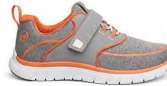
Sport Jogger Grey/Orange