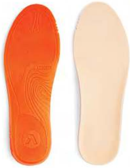
Tri-Lam Heat Moldable Inserts A5512 Reviewed