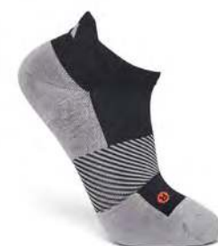
No Show Black