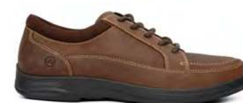
Casual Sport Oil Brown