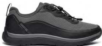
Sport Sprinter Black