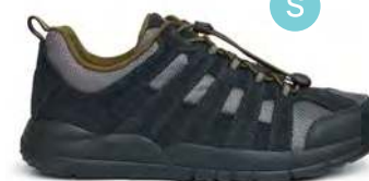
Trail Walker Dark Grey