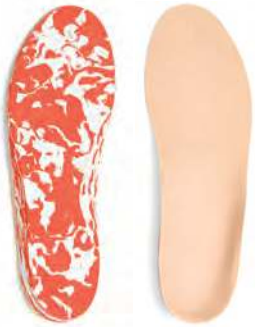
Custom Accommodative Inserts A5514 Reviewed