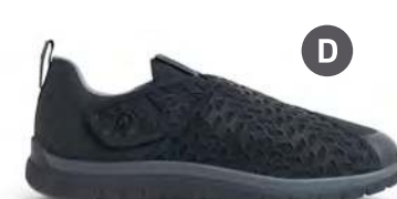
Sport Double-Depth Stretch Black