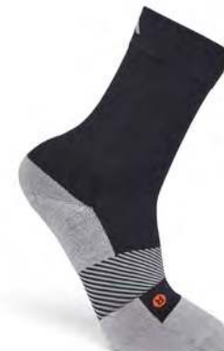
Crew Length Black