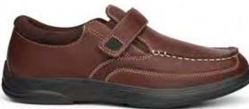
Casual Dress Whiskey