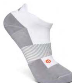
No Show White