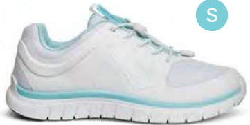
Sport Runner White/Blue