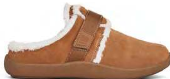
Open Back Camel