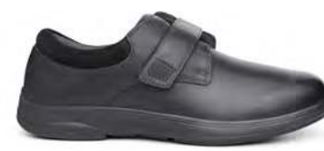
Casual Comfort Black