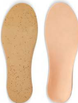
Custom Cork Inserts A5514 Reviewed