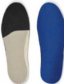
Semi-rigid Orthotics L3010/3020 Reviewed