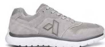
Sport Trainer Grey