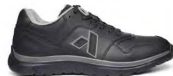
Sport Trainer Black