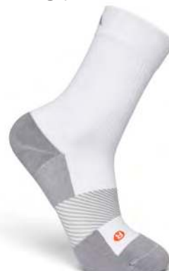
Crew Length White