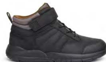
Trail Boot Oil Black