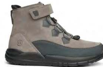
Trail Hiker Grey

The comfort you deserve. The style you desire. The support you require.