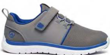
Sport Jogger Grey/Blue