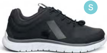
Sport Runner Black/Grey