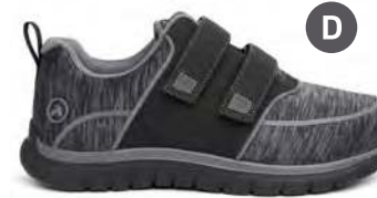
Sport Double Depth Black/Grey