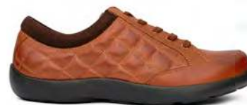
Casual Sport Saddle