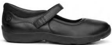
Casual Mary Jane Stretch Black Stretch