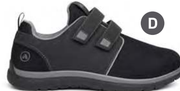
Sport Double Depth Black/Grey