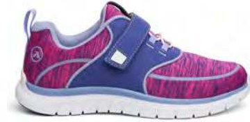
Sport Jogger Purple/Pink