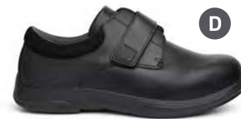
Casual Double Depth Black Stretch