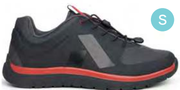
Sport Runner Black/Red