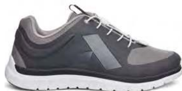
Sport Runner Grey/Black