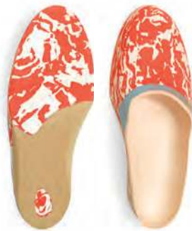
Partial Foot Toe Filler L5000 Reviewed