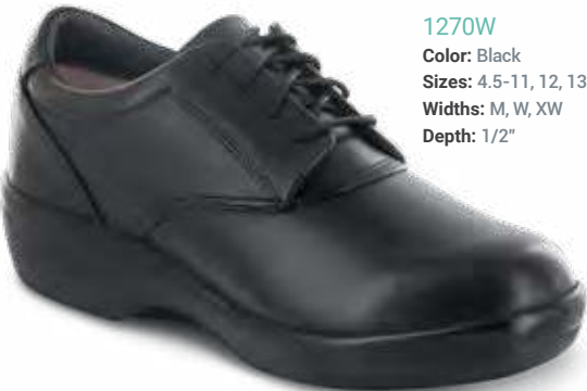
1270W Color: Black Sizes: 4.5-11, 12, 13 Widths: M, W, XW Depth: 1/2"