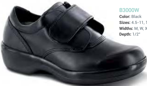
B3000W Color: Black Sizes: 4.5-11, 12, 13 Widths: M, W, XW Depth: 1/2"