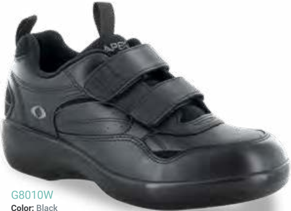
G8010W Color: Black Sizes: 4.5-11, 12, 13 Widths: M, W, XW Depth: 1/2"