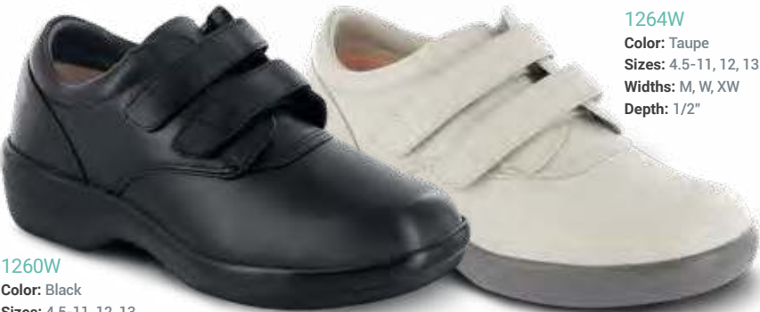
1260W Color: Black Sizes: 4.5-11, 12, 13 Widths: M, W, XW Depth: 1/2"