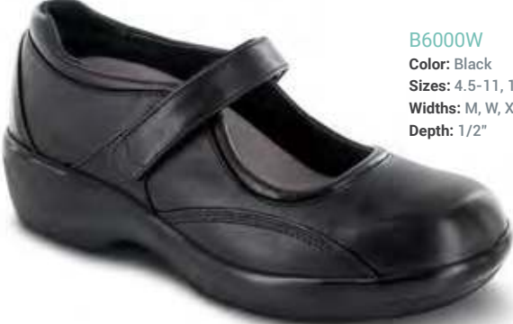
B6000W Color: Black Sizes: 4.5-11, 12, 13 Widths: M, W, XW Depth: 1/2"