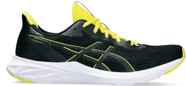
VERSABLAST™ 3 Style #: 1011B692-005 Colour: BLACK/BRIGHT YELLOW EOL: 05/31/2024