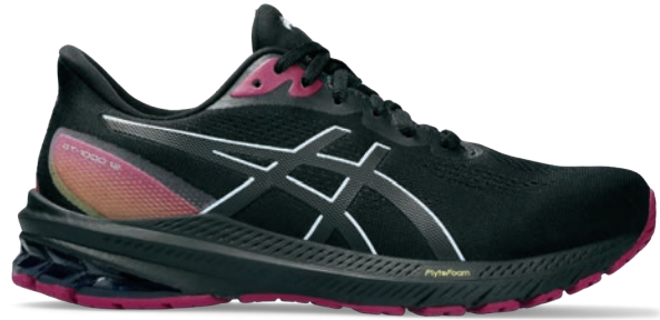
GT-1000® 12 GTX Style #: 1012B508-002 Colour: BLACK/LIGHT BLUE EOL: 05/31/2024