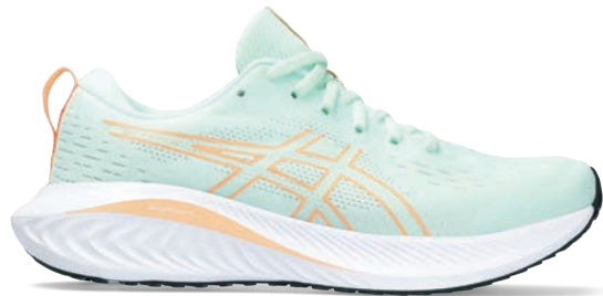
GEL-EXCITE™ 10 Style #: 1012B418-300 Colour: MINT TINT/BRIGHT ORANGE EOL: 05/31/2024