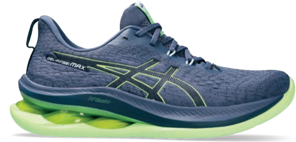
GEL-KINSEI® MAX Style #: 1011B696-401 Colour: THUNDER BLUE/ELECTRIC LIME EOL: 05/31/2024

Women's Size: 5-11 | Men's Size: 6-13,14,15