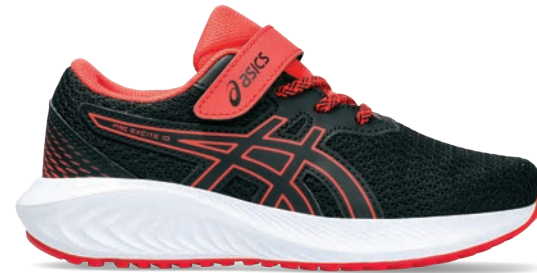
PRE EXCITE™ 10 PS Style #: 1014A297-007 Colour: BLACK/TRUE RED EOL: 05/31/2024