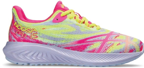
GEL-NOOSA TRI™ 15 GS Style #: 1014A311-701 Colour: HOT PINK/BLUE FADE EOL: 05/31/2024