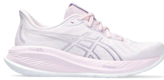
GEL-CUMULUS® 26 Style #: 1012B599-700 Colour: COSMOS/ASH ROCK EOL: 11/30/2024