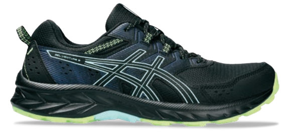
GEL-VENTURE™ 9 Style #: 1011B486-008 Colour: BLACK/ILLUMINATE MINT EOL: 12/31/2024