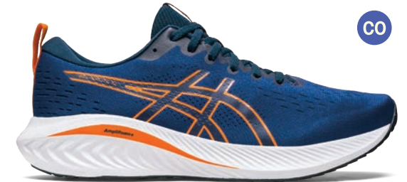
GEL-EXCITE™ 10 Style #: 1011B600-401 Colour: DEEP OCEAN/BRIGHT ORANGE EOL: 05/31/2024