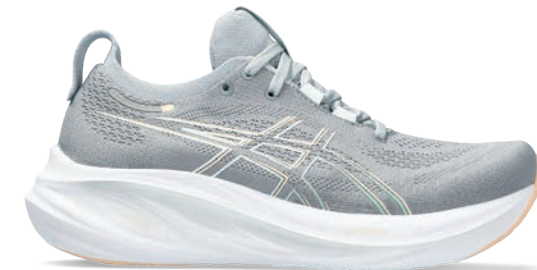
GEL-NIMBUS® 26 Style #: 1012B601-020 Colour: SHEET ROCK/PALE MINT EOL: 05/31/2024