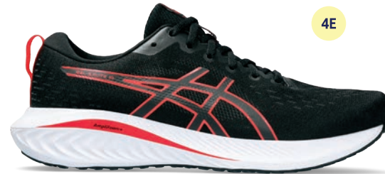
GEL-EXCITE™ 10 Style #: 1011B600-007 Style #: 1011B599-007 (4E) Colour: BLACK/TRUE RED EOL: 05/31/2024