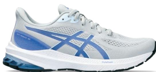
GT-1000® 12 Style #: 1012B450-021 Colour: PIEDMONT GREY/LIGHT BLUE EOL: 05/31/2024