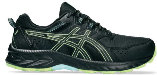
GEL-VENTURE™ 9 WATERPROOF Style #: 1011B705-002 Colour: BLACK/ILLUMINATE GREEN EOL: 05/31/2024

Women's Size: 5-12 | Men's Size: 7-13,14,15