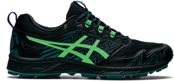
GEL-FUJISETSU™ 3 G-TX Style #: 1011A972-002 Colour: BLACK/NEW LEAF EOL: 05/31/2024

Women's Size: 5-12 | Men's Size: 6-13,14,15