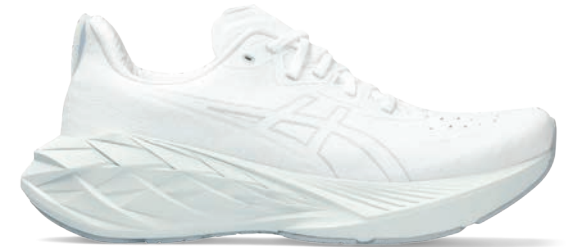
NOVABLAST™ 4 Style #: 1011B693-101 Colour: WHITE/PALE MINT EOL: 05/31/2024