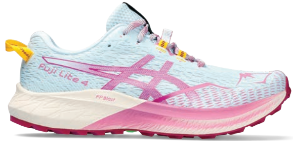
FUJI LITE™ 4 Style #: 1012B514-400 Colour: LIGHT BLUE/BLACKBERRY EOL: 05/31/2024