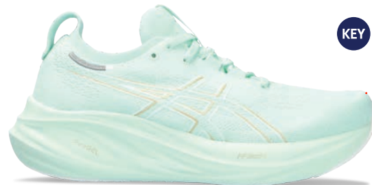
GEL-NIMBUS® 26 Style #: 1012B601-300 Colour: MINT TINT/PALE MINT EOL: 12/31/2024