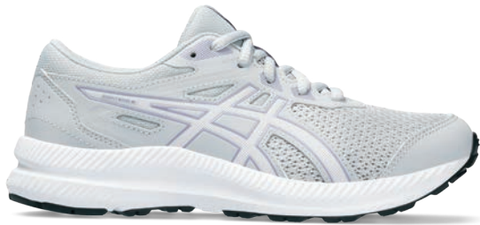
CONTEND™ 8 GS Style #: 1014A259-021 Colour: PIEDMONT GREY/COSMOS EOL: 05/31/2024