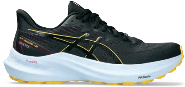
GT-2000® 12 GTX Style #: 1012B507-001 Colour: BLACK/SAFFRON EOL: 05/31/2024