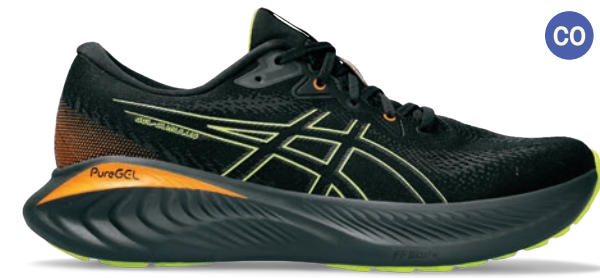
GEL-CUMULUS® 25 GTX Style #: 1011B683-001 Colour: BLACK/NEON LIME EOL: 05/31/2024

TOTAL STACK HEIGHT: 37.5mm-29.5mm // DROP: 8mm // WEIGHT: 8.4oz/238g*