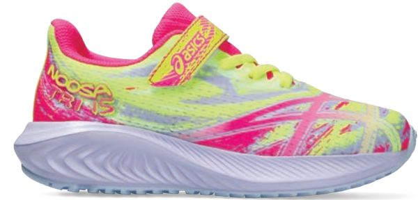
PRE NOOSA TRI™ 15 PS Style #: 1014A314-701 Colour: HOT PINK/BLUE FADE EOL: 05/31/2024