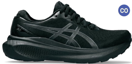
GEL-KAYANO® 30 Style #: 1012B357-001 Colour: BLACK/BLACK EOL: 05/31/2024