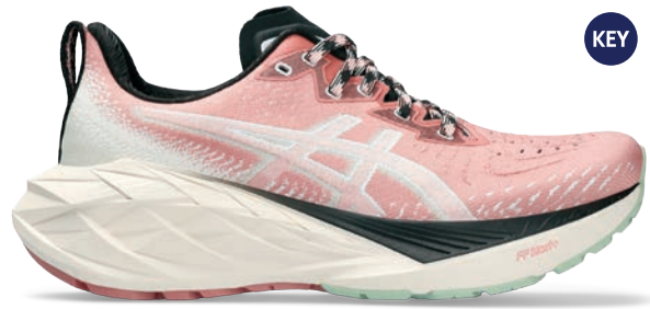
NOVABLAST™ 4 TR Style #: 1012B654-250 Colour: NATURE BATHING/ROSE ROUGE EOL: 05/31/2024

Women's Size: 5-12 | Men's Size: 6-13,14,15