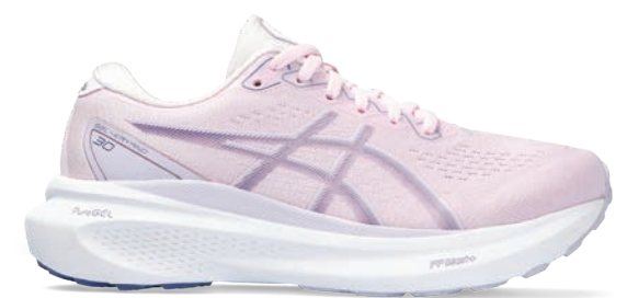
GEL-KAYANO® 30 Style #: 1012B357-702 Colour: COSMOS/ASH ROCK EOL: 05/31/2024