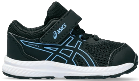
CONTEND™ 8 TS Style #: 1014A260-003 Colour: BLACK/WATERSCAPE EOL: 05/31/2024