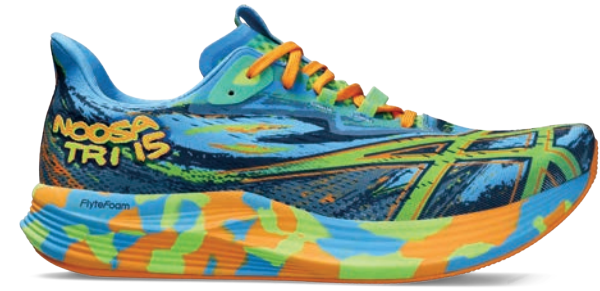
NOOSA TRI™ 15 Style #: 1011B609-403 Colour: WATERSCAPE/ELECTRIC LIME EOL: 05/31/2024

Women's Size: 5-12 | Men's Size: 6-13,14,15