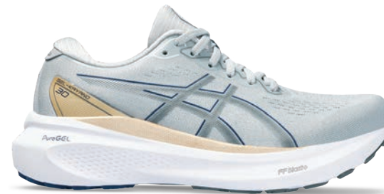
GEL-KAYANO® 30 Style #: 1012B357-023 Colour: PIEDMONT GREY/STEEL GREY EOL: 05/31/2024