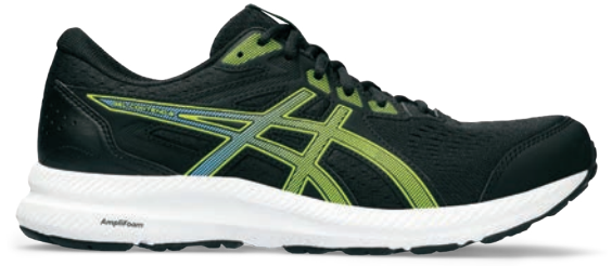
GEL-CONTEND™ 8 Style #: 1011B492-012 Colour: BLACK/ELECTRIC LIME EOL: 05/31/2024