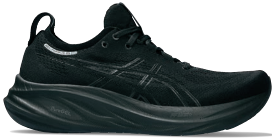
GEL-NIMBUS® 26 Style #: 1011B794-002 Colour: BLACK/BLACK EOL: 12/31/2024