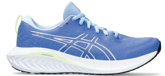
GEL-EXCITE™ 10 Style #: 1012B418-403 Colour: SAPPHIRE/PURE SILVER EOL: 05/31/2024