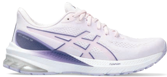
GT-1000® 12 Style #: 1012B450-701 Colour: COSMOS/DUSTY PURPLE EOL: 05/31/2024