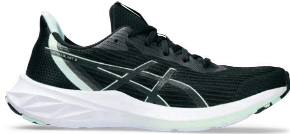
VERSABLAST™ 3 Style #: 1012B511-004 Colour: BLACK/MINT TINT EOL: 05/31/2024

Women's Size: 5-12 | Men's Size: 6-13,14