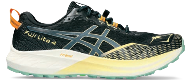
FUJI LITE™ 4 Style #: 1011B698-002 Colour: BLACK/MAGNETIC BLUE EOL: 05/31/2024

Women's Size: 5-12 | Men's Size: 6-13,14,15,16