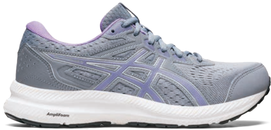
GEL-CONTEND™ 8 Style #: 1012B320-025 Colour: SHEET ROCK/DIGITAL VIOLET EOL: 09/30/2024