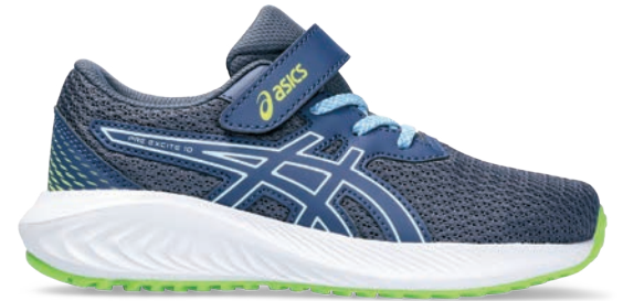
PRE EXCITE™ 10 PS Style #: 1014A297-403 Colour: THUNDER BLUE/LIGHT BLUE EOL: 05/31/2024