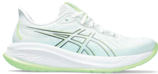
GEL-CUMULUS® 26 Style #: 1011B792-100 Colour: WHITE/SHEET ROCK EOL: 11/30/2024