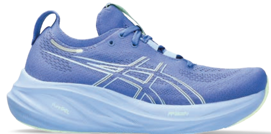
GEL-NIMBUS® 26 Style #: 1012B601-401 Colour: SAPPHIRE/LIGHT BLUE EOL: 05/31/2024