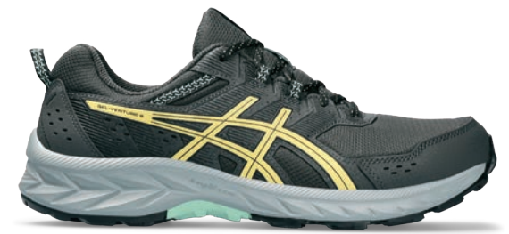
GEL-VENTURE™ 9 Style #: 1011B486-023 Colour: GRAPHITE GREY/FADED YELLOW EOL: 12/31/2024

MIDSOLE STACK HEIGHT: 21mm-11mm // DROP: 10mm // WEIGHT: 8.8oz/250g*