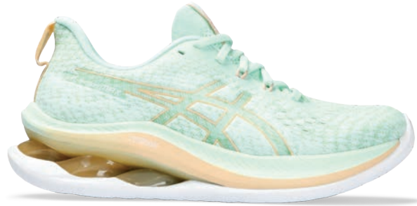
GEL-KINSEI® MAX Style #: 1012B512-300 Colour: MINT TINT/APRICOT CRUSH EOL: 05/31/2024