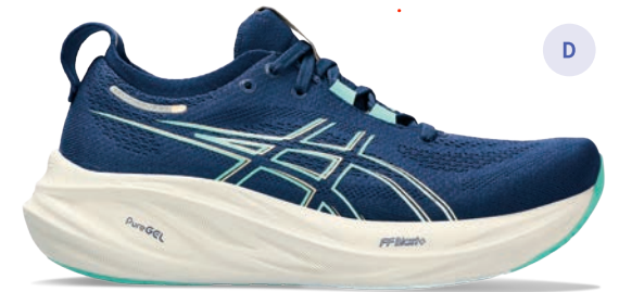
GEL-NIMBUS® 26 Style #: 1012B601-400 Style #: 1012B602-400(D) Colour: BLUE EXPANSE/AURORA GREEN EOL: 12/31/2024