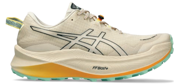
TRABUCO™ MAX 3 Style #: 1011B800-020 Colour: FEATHER GREY/BLACK EOL: 05/31/2024

Women's Size: 5-12 | Men's Size: 6-13,14,15