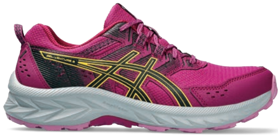
GEL-VENTURE™ 9 Style #: 1012B313-500 Colour: BLACKBERRY/BLACK EOL: 05/31/2024