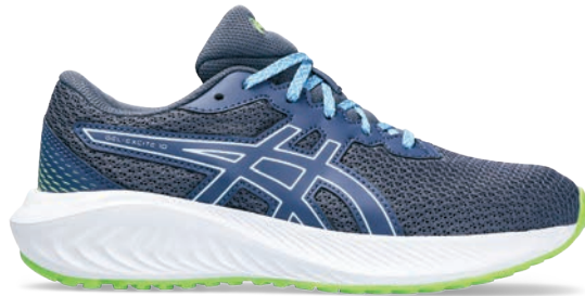
GEL-EXCITE™ 10 GS Style #: 1014A298-403 Colour: THUNDER BLUE/LIGHT BLUE EOL: 05/31/2024