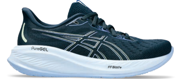
GEL-CUMULUS® 26 Style #: 1012B599-400 Colour: FRENCH BLUE/LIGHT SAPPHIRE EOL: 02/28/2025