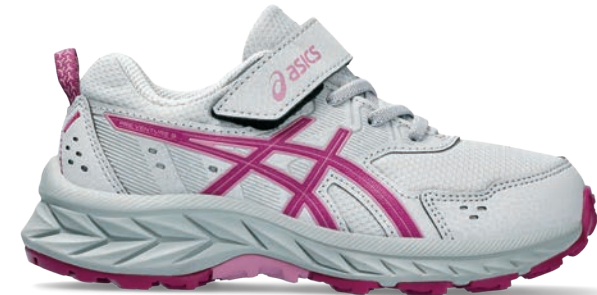
PRE VENTURE™ 9 PS Style #: 1014A277-021 Colour: PIEDMONT GREY/BLACKBERRY EOL: 05/31/2024

MIDSOLE STACK HEIGHT: 17.5mm-9mm // DROP: 8.5mm