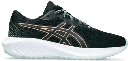
GEL-EXCITE™ 10 GS Style #: 1014A298-003 Colour: BLACK/BRIGHT SUNSTONE EOL: 05/31/2024