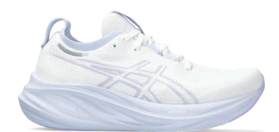
GEL-NIMBUS® 26 Style #: 1012B601-100 Colour: WHITE/FRESH AIR EOL: 05/31/2024