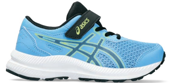
CONTEND™ 8 PS Style #: 1014A258-409 Colour: WATERSCAPE/BLACK EOL: 05/31/2024