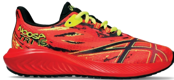
GEL-NOOSA TRI™ 15 GS Style #: 1014A311-600 Colour: SUNRISE RED/BLACK EOL: 05/31/2024