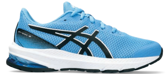
GT-1000® 12 GS Style #: 1014A296-404 Colour: WATERSCAPE/BLACK EOL: 05/31/2024