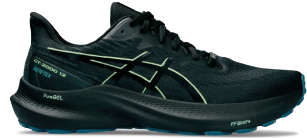
GT-2000® 12 GTX Style #: 1011B687-001 Colour: BLACK/ILLUMINATE GREEN EOL: 05/31/2024

Women's Size: 5-13 | Men's Size: 6-14,15,16,17