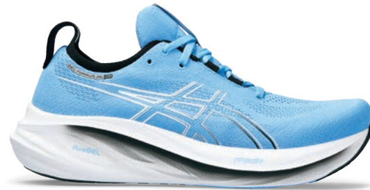
GEL-NIMBUS® 26 Style #: 1011B794-401 Colour: WATERSCAPE/BLACK EOL: 05/31/2024