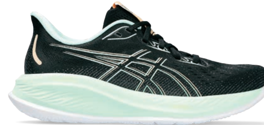
GEL-CUMULUS® 26 Style #: 1012B599-001 Colour: BLACK/MINT TINT EOL: 11/30/2024