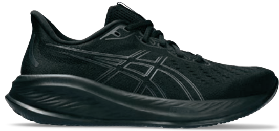
GEL-CUMULUS® 26 Style #: 1011B792-003 Colour: BLACK/BLACK EOL: 11/30/2024