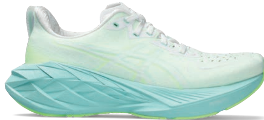
NOVABLAST™ 4 Style #: 1012B510-100 Colour: WHITE/ILLUMINATE MINT EOL: 05/31/2024