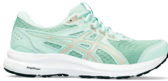
GEL-CONTEND™ 8 Style #: 1012B320-301 Colour: MINT TINT/CHAMPAGNE EOL: 09/30/2024