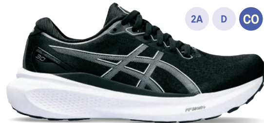
GEL-KAYANO® 30 Style #: 1012B357-002 Style #: 1012B505-002 (2A) Style #: 1012B503-002 (D) Colour: BLACK/SHEET ROCK EOL: 05/31/2024