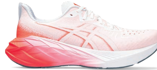
NOVABLAST™ 4 Style #: 1011B845-100 Colour: WHITE/SUNRISE RED EOL: 03/01/2024

TOTAL STACK HEIGHT: 40.5mm-32.5mm // DROP: 8mm // WEIGHT: 7.9oz/225g*