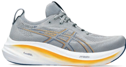
GEL-NIMBUS® 26 Style #: 1011B794-020 Colour: SHEET ROCK/THUNDER BLUE EOL: 12/31/2024