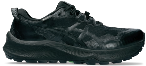
GEL-TRABUCO™ 12 GTX Style #: 1012B607-002 Colour: BLACK/GRAPHITE GREY EOL: 05/31/2024