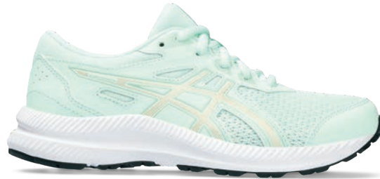
CONTEND™ 8 GS Style #: 1014A259-301 Colour: MINT TINT/CHAMPAGNE EOL: 05/31/2024