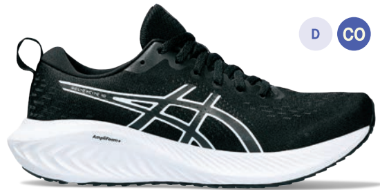
GEL-EXCITE™ 10 Style #: 1012B418-003 Style #: 1012B420-003 (D) Colour: BLACK/WHITE EOL: 05/31/2024