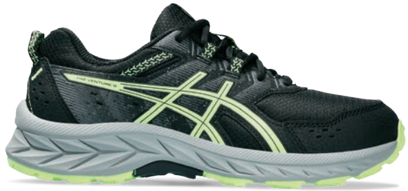
PRE VENTURE™ 9 GS Style #: 1014A276-004 Colour: BLACK/ILLUMINATE GREEN EOL: 05/31/2024