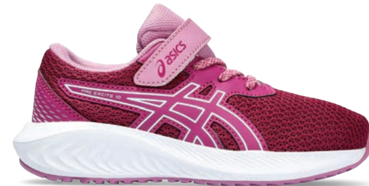
PRE EXCITE™ 10 PS Style #: 1014A297-500 Colour: BLACKBERRY/LIGHT BLUE EOL: 05/31/2024