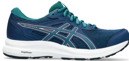
GEL-CONTEND™ 8 Style #: 1012B320-413 Colour: BLUE EXPANSE/RICH TEAL EOL: 05/31/2024