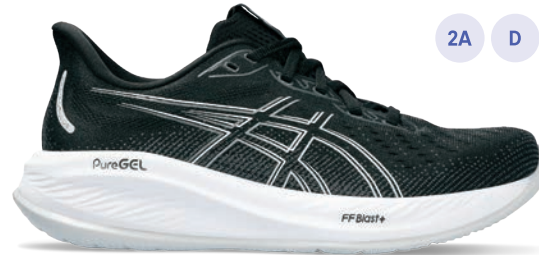
GEL-CUMULUS® 26 Style #: 1012B599-002 Style #: 1012B609-002 (2A) Style #: 1012B600-002 (D) Colour: BLACK/CONCRETE EOL: 02/28/2025