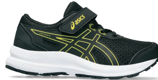
CONTEND™ 8 PS Style #: 1014A258-009 Colour: BLACK/BRIGHT YELLOW EOL: 05/31/2024