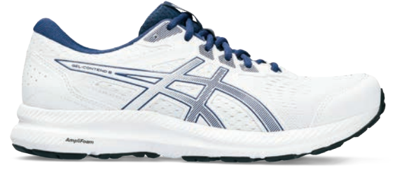
GEL-CONTEND™ 8 Style #: 1011B492-104 Colour: WHITE/BLUE EXPANSE EOL: 09/30/2024

MIDSOLE STACK HEIGHT: 21mm-11mm // DROP: 10mm // WEIGHT: 7.8oz/220g*