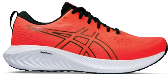
GEL-EXCITE™ 10 Style #: 1011B600-600 Colour: SUNRISE RED/GUNMETAL EOL: 05/31/2024