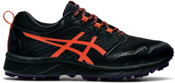
GEL-FUJISETSU™ 3 G-TX Style #: 1012A846-002 Colour: BLACK/NOVA ORANGE EOL: 05/31/2024