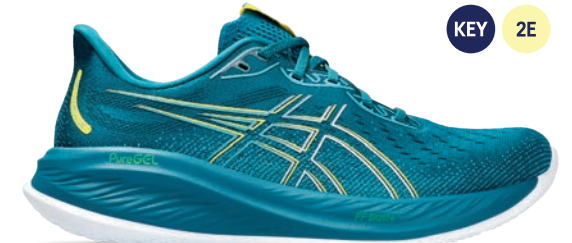
GEL-CUMULUS® 26 Style #: 1011B792-400 Style #: 1011B793-400 (2E) Colour: EVENING TEAL/BRIGHT YELLOW EOL: 02/28/2025