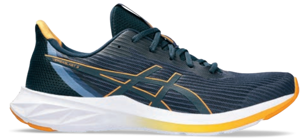
VERSABLAST™ 3 Style #: 1011B692-402 Colour: THUNDER BLUE/FELLOW YELLOW EOL: 05/31/2024

TOTAL STACK HEIGHT: 31.5mm-21.5mm // DROP: 10mm // WEIGHT: 6.2oz/176g*