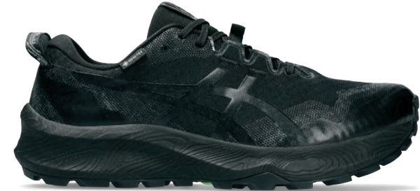
GEL-TRABUCO™ 12 GTX Style #: 1011B801-002 Colour: BLACK/GRAPHITE GREY EOL: 05/31/2024

Women's Size: 5-12 | Men's Size: 6-13,14,15,16