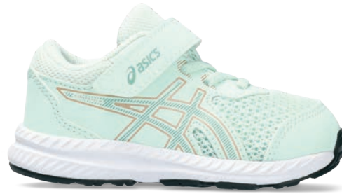
CONTEND™ 8 TS Style #: 1014A260-301 Colour: MINT TINT/DARK MINT EOL: 05/31/2024