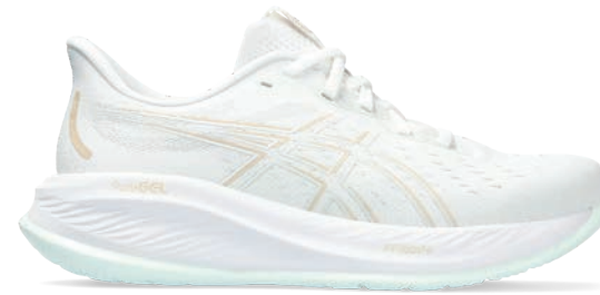
GEL-CUMULUS® 26 Style #: 1012B599-100 Colour: WHITE/PALE MINT EOL: 11/30/2024