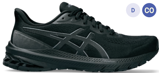
GT-1000® 12 Style #: 1012B450-001 Style #: 1012B447-001 (D) Colour: BLACK/CARRIER GREY EOL: 05/31/2024

Women's Size: 5-12 | Men's Size: 6-13,14,15,16,17