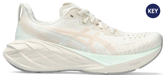
NOVABLAST™ 4 Style #: 1012B510-250 Colour: OATMEAL/MOONROCK EOL: 05/31/2024

Women's Size: 5-12 | Men's Size: 6-13,14,15