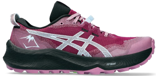
GEL-TRABUCO™ 12 Style #: 1012B605-500 Colour: BLACKBERRY/LIGHT BLUE EOL: 05/31/2024