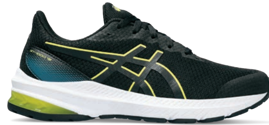
GT-1000® 12 GS Style #: 1014A296-005 Colour: BLACK/BRIGHT YELLOW EOL: 05/31/2024