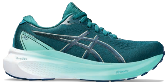
GEL-KAYANO® 30 Style #: 1012B357-301 Colour: RICH TEAL/BLUE EXPANSE EOL: 05/31/2024