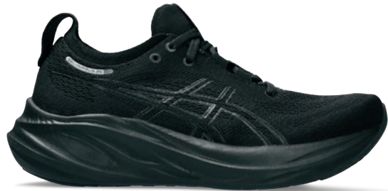
GEL-NIMBUS® 26 Style #: 1012B601-002 Colour: BLACK/BLACK EOL: 12/31/2024