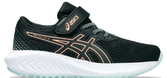
PRE EXCITE™ 10 PS Style #: 1014A297-003 Colour: BLACK/BRIGHT SUNSTONE EOL: 05/31/2024

STACK HEIGHT: 00mm-00mm // DROP: 0mm // WEIGHT: 0oz/0g*