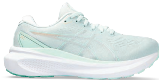
GEL-KAYANO® 30 Style #: 1012B357-300 Colour: PALE MINT/MINT TINT EOL: 05/31/2024