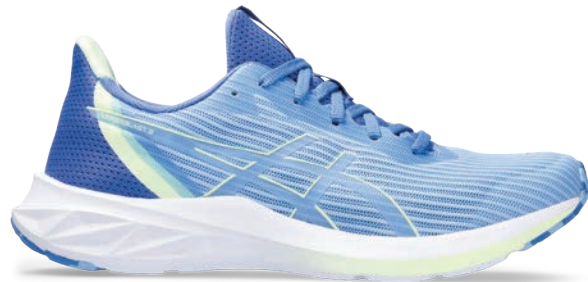
VERSABLAST™ 3 Style #: 1012B511-402 Colour: LIGHT SAPPHIRE/ILLUMINATE YELLOW EOL: 05/31/2024