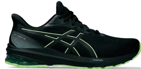
GT-1000® 12 GTX Style #: 1011B684-002 Colour: BLACK/ILLUMINATE GREEN EOL: 05/31/2024

Women's Size: 5-12 | Men's Size: 6-13,14,15,16,17