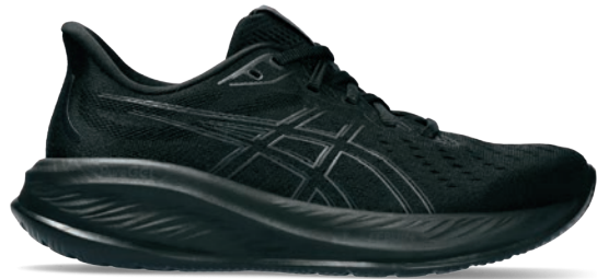
GEL-CUMULUS® 26 Style #: 1012B599-003 Colour: BLACK/BLACK EOL: 11/30/2024