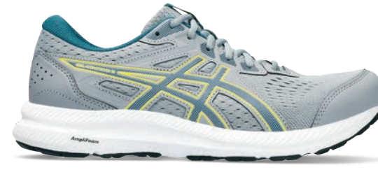
GEL-CONTEND™ 8 Style #: 1011B492-027 Colour: SHEET ROCK/EVENING TEAL EOL: 09/30/2024