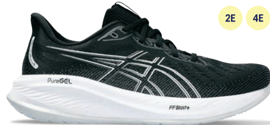
GEL-CUMULUS® 26 Style #: 1011B792-002 Style #: 1011B793-002 (2E) Style #: 1011B791-002 (4E) Colour: BLACK/CONCRETE EOL: 02/28/2025