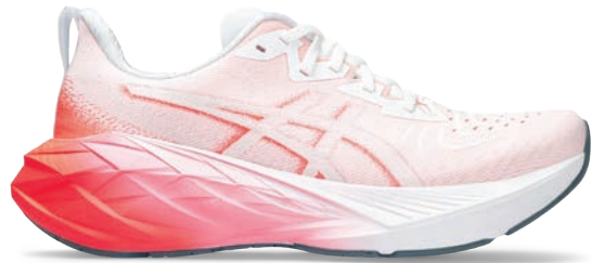
NOVABLAST™ 4 Style #: 1012B650-100 Colour: WHITE/SUNRISE RED EOL: 03/01/2024