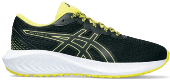
GEL-EXCITE™ 10 GS Style #: 1014A298-008 Colour: BLACK/BRIGHT YELLOW EOL: 05/31/2024