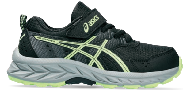
PRE VENTURE™ 9 PS Style #: 1014A277-004 Colour: BLACK/ILLUMINATE GREEN EOL: 05/31/2024