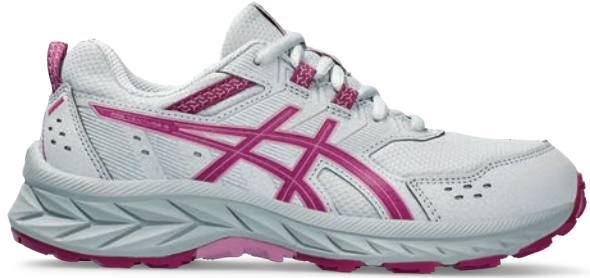
PRE VENTURE™ 9 GS Style #: 1014A276-021 Colour: PIEDMONT GREY/BLACKBERRY EOL: 05/31/2024