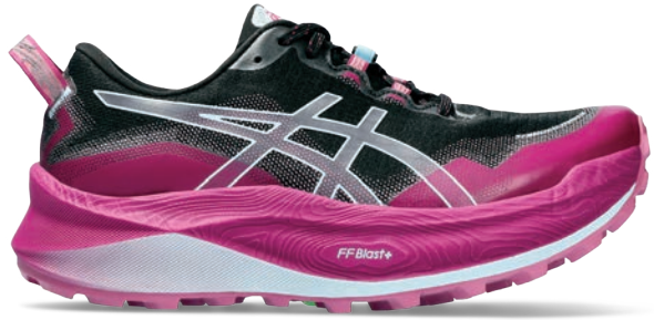
TRABUCO™ MAX 3 Style #: 1012B606-001 Colour: BLACK/LIGHT BLUE EOL: 05/31/2024