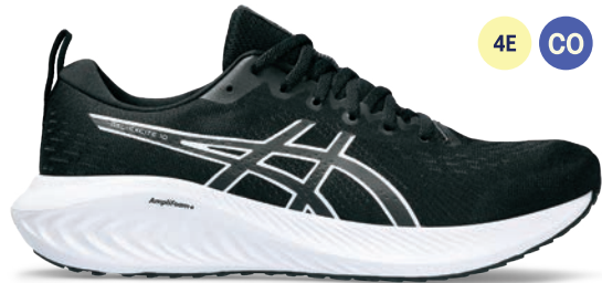
GEL-EXCITE™ 10 Style #: 1011B600-003 Style #: 1011B599-003 (4E) Colour: BLACK/WHITE EOL: 05/31/2024