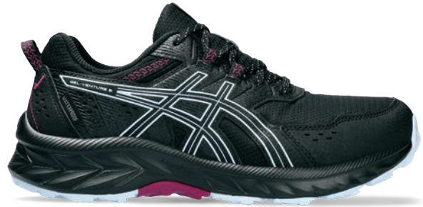
GEL-VENTURE™ 9 WATERPROOF Style #: 1012B519-003 Colour: BLACK/LIGHT BLUE EOL: 05/31/2024