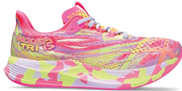
NOOSA TRI™ 15 Style #: 1012B429-700 Colour: HOT PINK/SAFETY YELLOW EOL: 05/31/2024