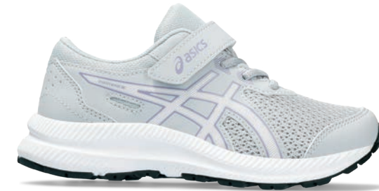
CONTEND™ 8 PS Style #: 1014A258-021 Colour: PIEDMONT GREY/COSMOS EOL: 05/31/2024