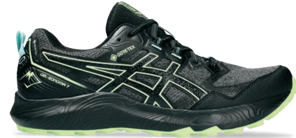
GEL-SONOMA™ 7 GTX Style #: 1011B593-004 Colour: BLACK/ILLUMINATE GREEN EOL: 05/31/2024

Women's Size: 5-12 | Men's Size: 6-13,14,15