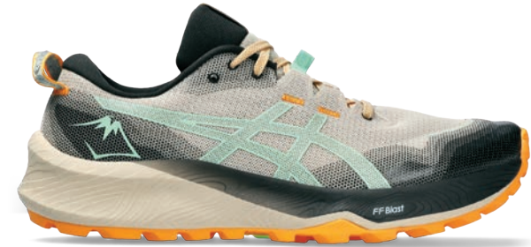
GEL-TRABUCO™ 12 Style #: 1011B799-020 Colour: FEATHER GREY/DARK MINT EOL: 05/31/2024

Women's Size: 5-12 | Men's Size: 6-13,14,15,16