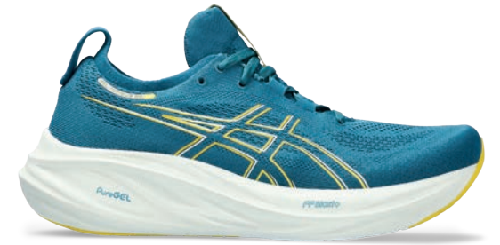
GEL-NIMBUS® 26 Style #: 1011B794-402 Colour: EVENING TEAL/LIGHT MUSTARD EOL: 05/31/2024