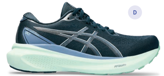
GEL-KAYANO® 30 Style #: 1012B357-403 Style #: 1012B503-403 (D) Colour: FRENCH BLUE/DENIM BLUE EOL: 05/31/2024