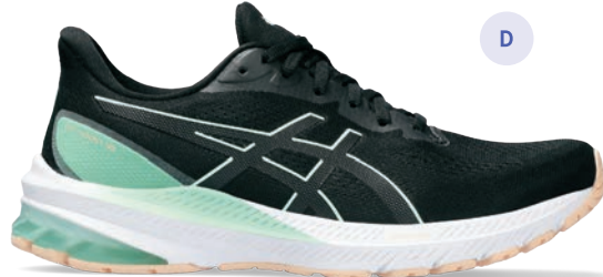
GT-1000® 12 Style #: 1012B450-006 Style #: 1012B447-006 (D) Colour: BLACK/MINT TINT EOL: 05/31/2024