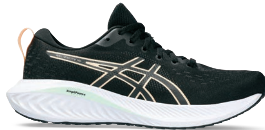
GEL-EXCITE™ 10 Style #: 1012B418-005 Colour: BLACK/APRICOT CRUSH EOL: 05/31/2024