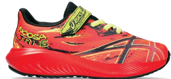
PRE NOOSA TRI™ 15 PS Style #: 1014A314-600 Colour: SUNRISE RED/BLACK EOL: 05/31/2024

MIDSOLE STACK HEIGHT: 19.5mm-11mm // DROP: 8.5mm // WEIGHT: 6.8oz/194g*