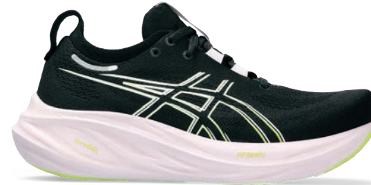
GEL-NIMBUS® 26 Style #: 1012B601-004 Colour: BLACK/NEON LIME EOL: 05/31/2024