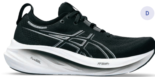
GEL-NIMBUS® 26 Style #: 1012B601-001 Style #: 1012B602-001 (D) Colour: BLACK/GRAPHITE GREY EOL: 12/31/2024