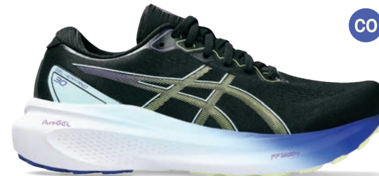
GEL-KAYANO® 30 Style #: 1012B357-003 Colour: BLACK/GLOW YELLOW EOL: 05/31/2024