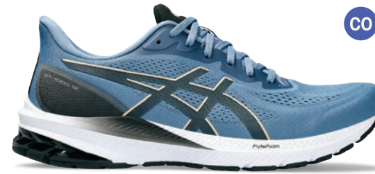
GT-1000® 12 Style #: 1011B631-401 Colour: STORM BLUE/DUNE EOL: 05/31/2024