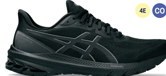
GT-1000® 12 Style #: 1011B631-001 Style #: 1011B629-001 (4E) Colour: BLACK/CARRIER GREY EOL: 05/31/2024