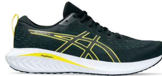
GEL-EXCITE™ 10 Style #: 1011B600-008 Colour: BLACK/BRIGHT YELLOW EOL: 05/31/2024