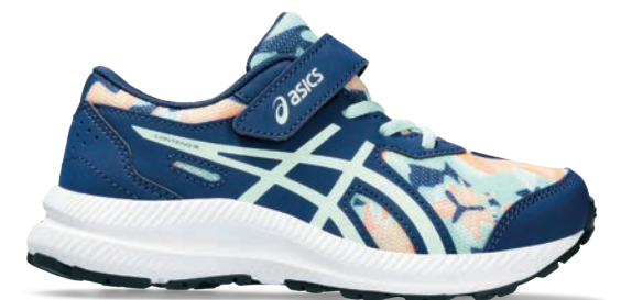
CONTEND™ 8 PS Style #: 1014A293-402 Colour: BLUE EXPANSE/MINT TINT EOL: 05/31/2024

MIDSOLE STACK HEIGHT: 20mm-10mm // DROP: 10mm