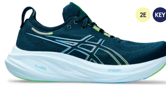
GEL-NIMBUS® 26 Style #: 1011B794-400 Style #: 1011B795-400 (2E) Colour: FRENCH BLUE/ELECTRIC LIME EOL: 12/31/2024