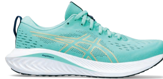
GEL-EXCITE™ 10 Style #: 1012B418-301 Colour: AURORA GREEN/CHAMPAGNE EOL: 05/31/2024