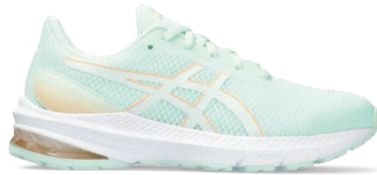
GT-1000® 12 GS Style #: 1014A296-300 Colour: MINT TINT/PALE MINT EOL: 05/31/2024