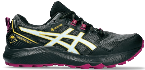
GEL-SONOMA™ 7 GTX Style #: 1012B414-004 Colour: BLACK/LIGHT BLUE EOL: 05/31/2024