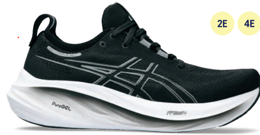
GEL-NIMBUS® 26 Style #: 1011B794-001 Style #: 1011B795-001 (2E) Style #: 1011B796-001 (4E) Colour: BLACK/GRAPHITE GREY EOL: 12/31/2024