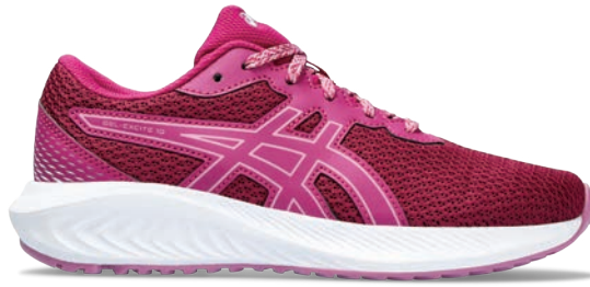
GEL-EXCITE™ 10 GS Style #: 1014A298-500 Colour: BLACKBERRY/SOFT BERRY EOL: 05/31/2024