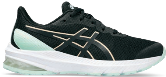
GT-1000® 12 GS Style #: 1014A296-006 Colour: BLACK/APRICOT CRUSH EOL: 05/31/2024