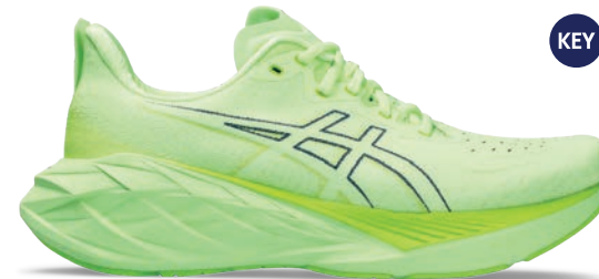
NOVABLAST™ 4 Style #: 1011B693-300 Colour: ILLUMINATE GREEN/LIME BURST EOL: 05/31/2024