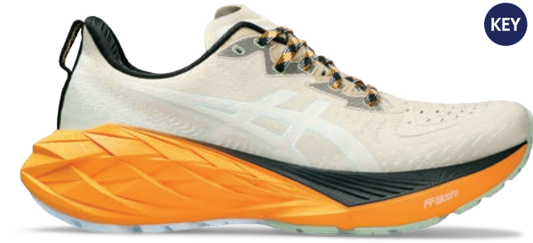
NOVABLAST™ 4 TR Style #: 1011B850-250 Colour: NATURE BATHING/FELLOW YELLOW EOL: 05/31/2024

TOTAL STACK HEIGHT: 42.5mm-34.5mm // DROP: 8mm // WEIGHT: 8.3oz/235g*