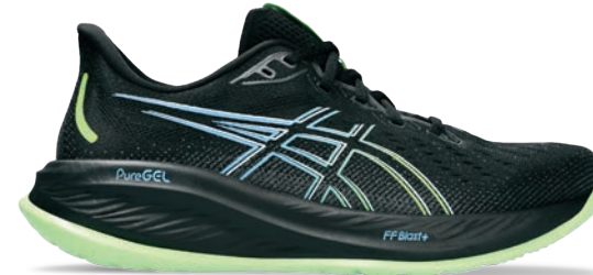
GEL-CUMULUS® 26 Style #: 1011B792-001 Colour: BLACK/ELECTRIC LIME EOL: 11/30/2024