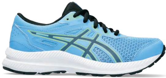
CONTEND™ 8 GS Style #: 1014A259-409 Colour: WATERSCAPE/BLACK EOL: 05/31/2024