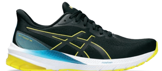
GT-1000® 12 Style #: 1011B631-005 Colour: BLACK/BRIGHT YELLOW EOL: 05/31/2024