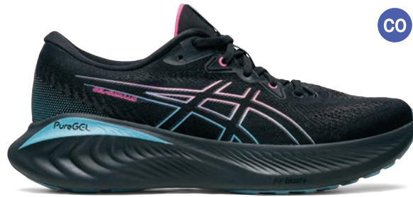
GEL-CUMULUS® 25 GTX Style #: 1012B502-001 Colour: BLACK/HOT PINK EOL: 05/31/2024

Women's Size: 5-12 | Men's Size: 6-13,14,15,16