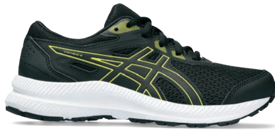
CONTEND™ 8 GS Style #: 1014A259-009 Colour: BLACK/BRIGHT YELLOW EOL: 05/31/2024