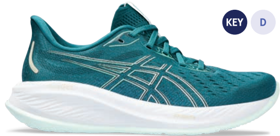
GEL-CUMULUS® 26 Style #: 1012B599-300 Style #: 1012B600-300 (D) Colour: RICH TEAL/PALE MINT EOL: 02/28/2025