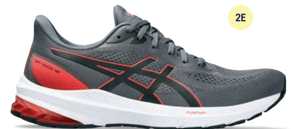
GT-1000® 12 Style #: 1011B631-021 Style #: 1011B634-021 (2E) Colour: CARRIER GREY/TRUE RED EOL: 05/31/2024

TOTAL STACK HEIGHT: 31.5mm-23.5mm // DROP: 8mm // WEIGHT: 8.3oz/235g*