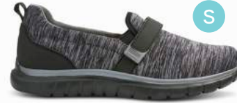
No. 11 | Sport Trainer Black/Grey