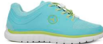
No. 23 | Sport Runner Teal/Lime