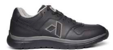
No. 50 | Sport Trainer Black