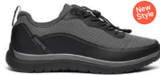
No. 16 | Sport Sprinter Black