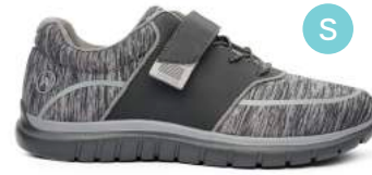
No. 45 | Sport Jogger Black/Grey