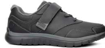
No. 38 | Sport Walker Black