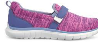
No. 11 | Sport Trainer Purple/Pink