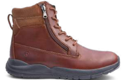
No. 90 | Trail Worker Whiskey