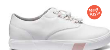
No. 93 | Casual Sneaker White