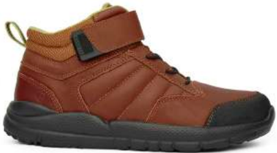
No. 55 | Trail Boot Whiskey