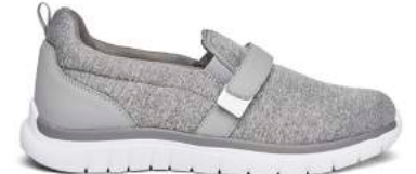
No. 11 | Sport Trainer Grey