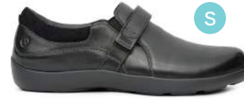
No. 51 | Casual Dress Black