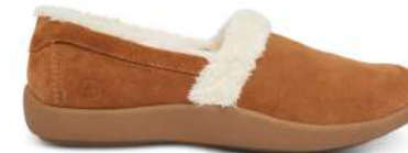
No. 21 | Smooth Toe Camel