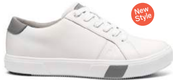
No. 27 | Casual Sneaker White