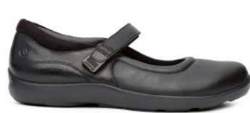
No. 33 | Casual Mary Jane Stretch Black Stretch