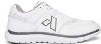
No. 50 | Sport Trainer White