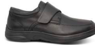
No. 28 | Casual Oxford Black