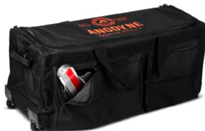
No. 103 | Travel Bag 24 individual shoes with inserts Foot measuring device