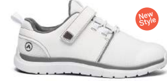
No. 46 | Sport Jogger White/Grey