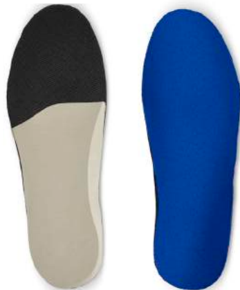
No. 5 | Semi-rigid Orthotics Leather/Spenco Topcover Semi-rigid EVA Base L3010/3020 Reviewed