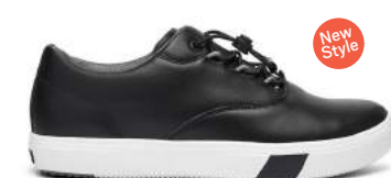
No. 93 | Casual Sneaker Black