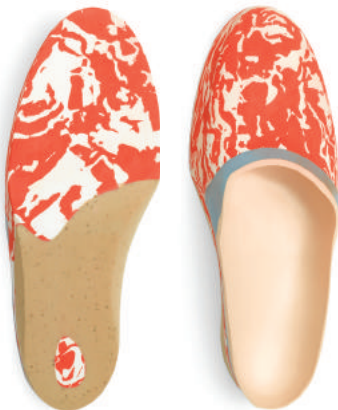
No. 4 | Partial Foot Toe Filler PE Topcover - Poron Midlayer EVA/Cork Base - L5000 Reviewed