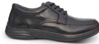
No. 12 | Casual Oxford Black