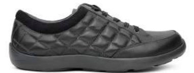
No. 75 | Casual Sport Black