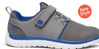
No. 46 | Sport Jogger Grey/Blue