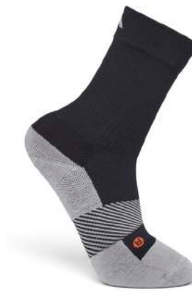
No. 7 | Crew Length Black