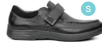
No. 52 | Casual Dress Black