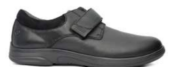
No. 66 | Casual Comfort Stretch Black Stretch