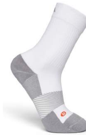
No. 7 | Crew Length White