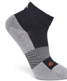
No. 8 | Quarter Length Black