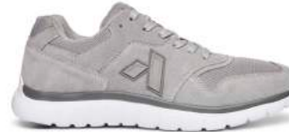
No. 50 | Sport Trainer Grey