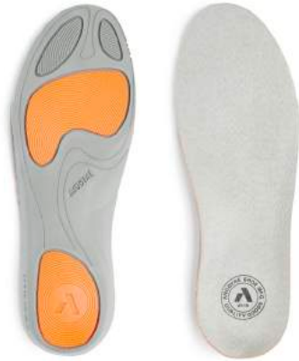
No. 2 | Gel-Foam Hybrid Inserts Microfiber Top Cover - Foam Mid-Layer Shock Absorbing Base - Ergonomic Gel