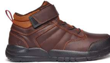
No. 56 | Trail Boot Whiskey