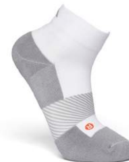
No. 8 | Quarter Length White