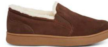
No. 18 | Smooth Toe Espresso