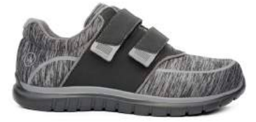
No. 77 | Sport Double Depth Black/Grey