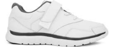
No. 38 | Sport Walker White