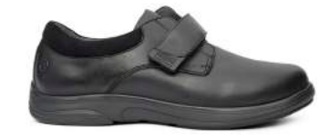
No. 88 | Casual Double Depth Black Stretch