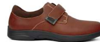
No. 64 | Casual Comfort Whiskey