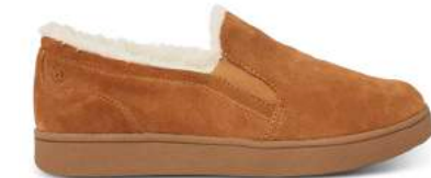
No. 18 | Smooth Toe Camel