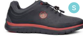
No. 22 | Sport Runner Black/Red