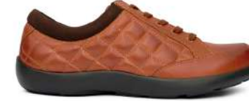
No. 75 | Casual Sport Saddle