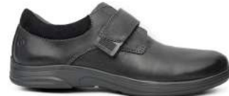
No. 64 | Casual Comfort Black