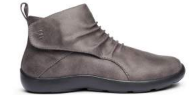
No. 91 | Casual Boot Grey