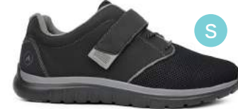
No. 46 | Sport Jogger Black/Grey