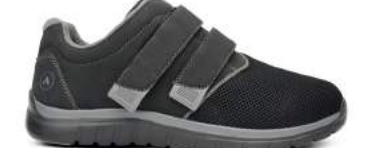
No. 74 | Sport Double Depth Black/Grey