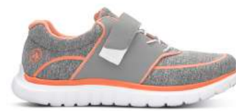
No. 45 | Sport Jogger Grey/Orange