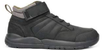
No. 56 | Trail Boot Oil Black