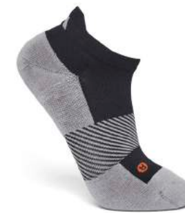
No. 9 | No Show Black