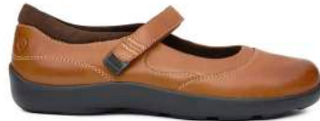
No. 19 | Casual Mary Jane Cognac