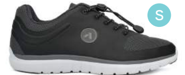
No. 23 | Sport Runner Black/Grey