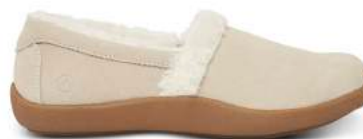
No. 21 | Smooth Toe Sand

As a diabetic, keeping your feet protected, safe, and accommodated is critical. Whether you're on concrete or carpet, walk at ease, knowing with Anodyne, your feet are safe, sound....and, most importantly, extremely comfortable.