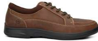
No. 72 | Casual Sport Oil Brown