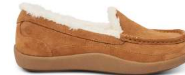
No. 39 | Moc Toe Camel