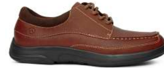
No. 30 | Casual Dress Whiskey