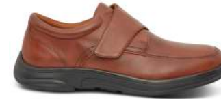
No. 28 | Casual Oxford Burnished Brown