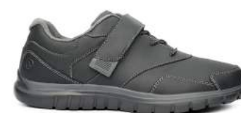
No. 31 | Sport Walker Black