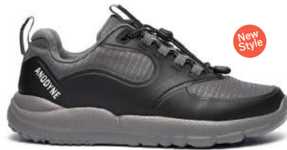
No. 47 | Trail Runner Black