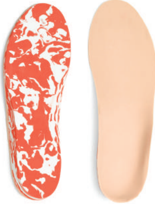
No. 3 | Custom Accommodative Inserts PE Topcover EVA Base - A5514 Reviewed