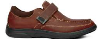
No. 52 | Casual Dress Whiskey