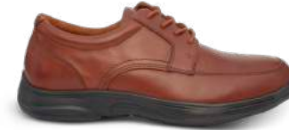
No. 12 | Casual Oxford Burnished Brown