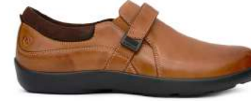
No. 51 | Casual Dress Cognac