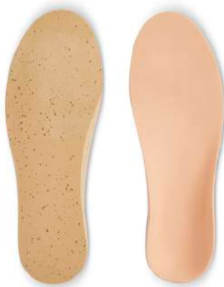
No. 6 | Custom Cork Inserts PE Topcover Cork Base - A5514 Reviewed