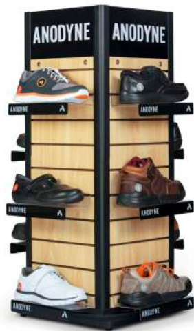
No. 102 | Countertop Display 12 individual shoes with inserts