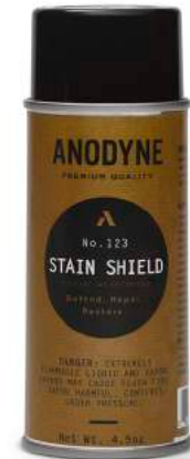
No. 123 | Stain Shield Protects & repels spills Defends against stains