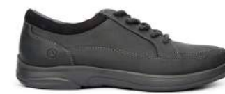
No. 72 | Casual Sport Oil Black