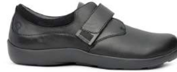
No. 67 | Casual Comfort Black