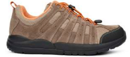
No. 44 | Trail Walker Stone