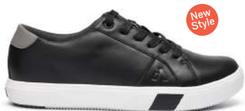
No. 27 | Casual Sneaker Black