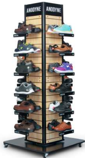
No. 101 | Full Fitting Center Display 48 individual shoes with inserts Foot measuring device