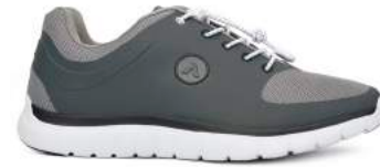
No. 22 | Sport Runner Grey/Black