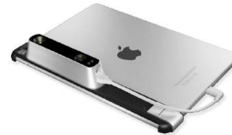
3D | iPad 3D Camera Anodyne App

Hand-crafted by our lab staff and based on the exact contours of a patient's feet, our Custom Accommodative Inserts and Partial Foot Toe Fillers allow for maximum foot support, total contact and enhanced stabilization. Moreover, our custom inserts can be used to isolate and individually treat any particular irregularity that a patient's feet may have. We're capable of adding any sort of special accommodation to a patients inserts, including the off-loading of certain areas, adding metatarsal pads, arch flanges, Morton's extensions, heel raises, etc.