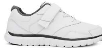
No. 31 | Sport Walker White