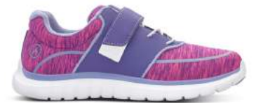
No. 45 | Sport Jogger Purple/Pink