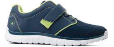
No. 46 | Sport Jogger Blue/Green