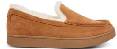
No. 34 | Moc Toe Camel