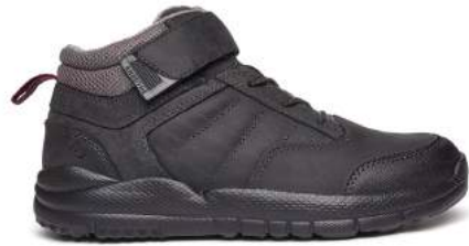
No. 55 | Trail Boot Oil Black