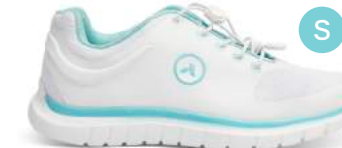
No. 23 | Sport Runner White/Blue