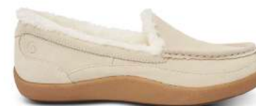
No. 39 | Moc Toe Sand