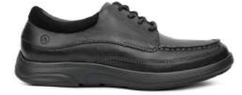
No. 30 | Casual Dress Black