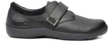
No. 63 | Casual Comfort Stretch Black Stretch