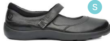
No. 19 | Casual Mary Jane Black