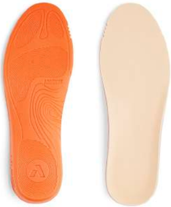
No. 1 | Tri-Lam Heat Moldable Inserts Low-Sheering Top Cover Cushioned Mid-Layer Heat Moldable Base A5512 Reviewed