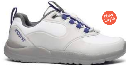
No. 47 | Trail Runner White