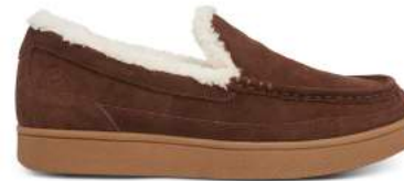
No. 34 | Moc Toe Espresso

As a diabetic, keeping your feet protected, safe, and accommodated is critical. Whether you're on concrete or carpet, walk at ease, knowing with Anodyne, your feet are safe, sound....and, most importantly, extremely comfortable.