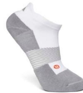
No. 9 | No Show White