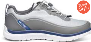
No. 16 | Sport Sprinter Grey