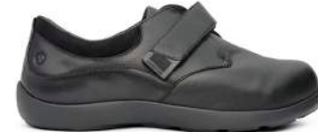
No. 81 | Casual Double Depth Black Stretch