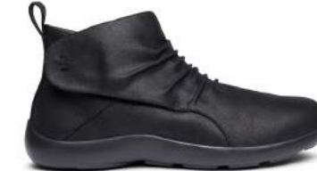
No. 91 | Casual Boot Black