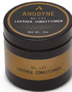
No. 121 | Leather Conditioner Softens & protects leather Replenishes color & natural oils Cleans & conditions