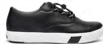
Casual Sneaker Black