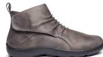
Casual Boot Grey