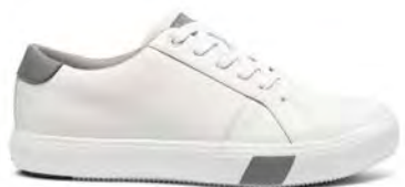
Casual Sneaker White