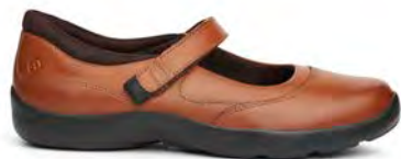
Casual Mary Jane Cognac