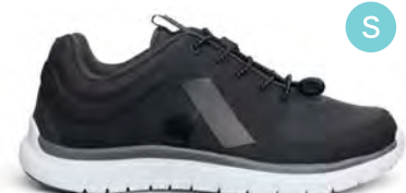
Sport Runner Black/Grey