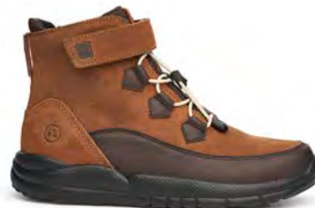
Trail Hiker Almond