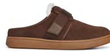
Open Back Espresso