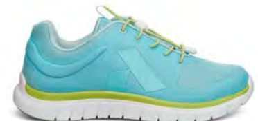
Sport Runner Teal/Lime