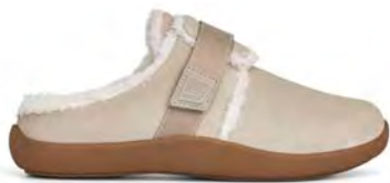
Open Back Sand