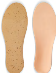
Custom Cork Inserts A5514 Reviewed