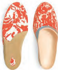
Partial Foot Toe Filler L5000 Reviewed