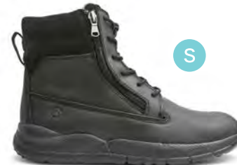
Trail Worker Oil Black