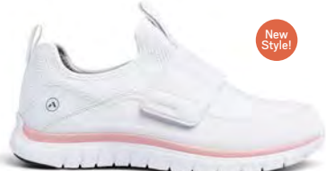
Sport Sprinter White