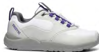
Trail Runner White