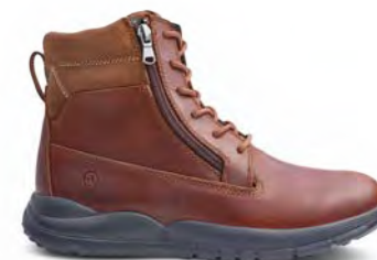
Trail Worker Whiskey