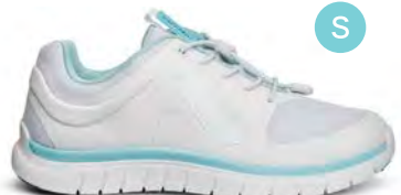
Sport Runner White/Blue