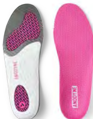
Standard Multi Density Orthotic