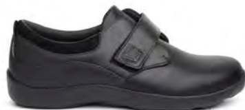
Casual Comfort Stretch Black Stretch