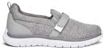
Sport Trainer Grey