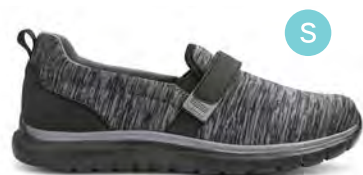
Sport Trainer Black/Grey