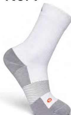
Crew Length White