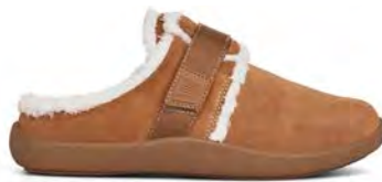
Open Back Camel