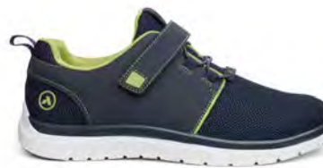
Sport Jogger Blue/Green