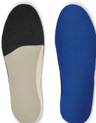
Semi-Rigid Orthotics L3010/3020 Reviewed