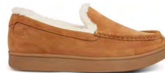
Moc Toe Camel