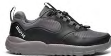
Trail Runner Black