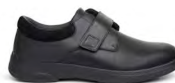
Casual Comfort Stretch Black Stretch