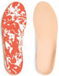
Custom Accommodative Inserts A5514 Reviewed