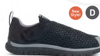
Sport Double Depth Stretch Black