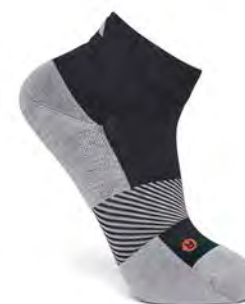
Quarter Length Black