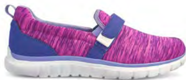
Sport Trainer Purple/Pink