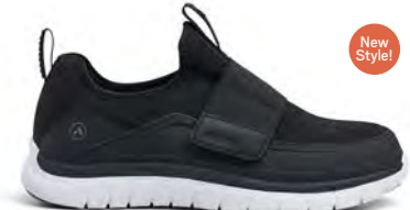
Sport Sprinter Black