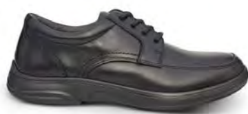
Casual Oxford Black