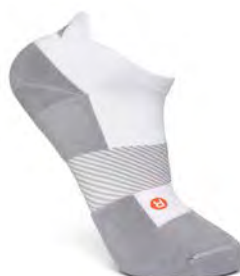
No Show White