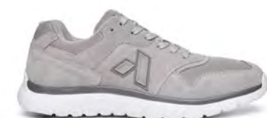
Sport Trainer Grey