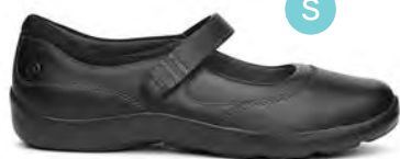
Casual Mary Jane Black