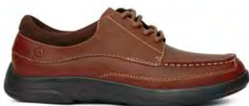
Casual Dress Whiskey