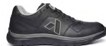
Sport Trainer Black