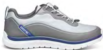
Sport Sprinter Grey