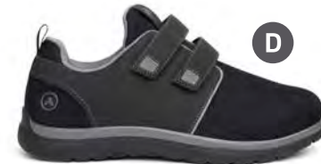
Sport Double Depth Black/Grey