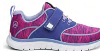
Sport Jogger Purple/Pink