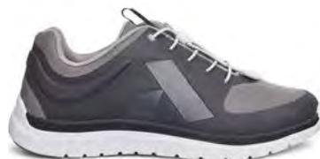
Sport Runner Grey/Black