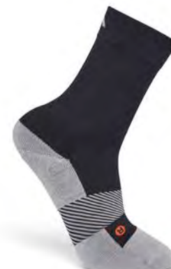
Crew Length Black