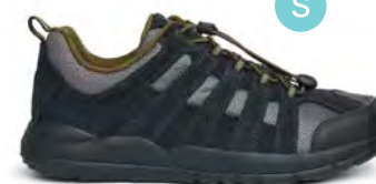
Trail Walker Dark Grey