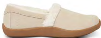
Smooth Toe Sand