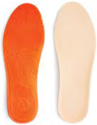
Tri-Lam Heat Moldable Inserts A5512 Reviewed