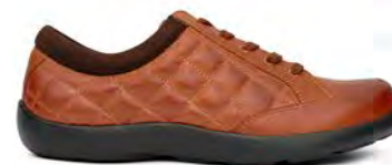
Casual Sport Saddle