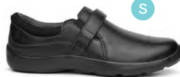
Casual Dress Black