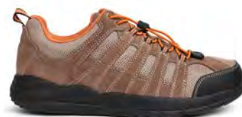
Trail Walker Stone