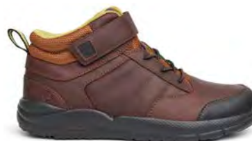
Trail Boot Whiskey