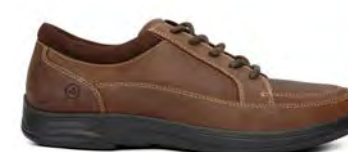
Casual Sport Oil Brown