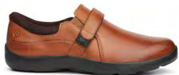
Casual Dress Cognac