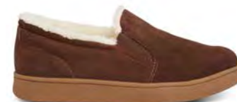
Smooth Toe Espresso