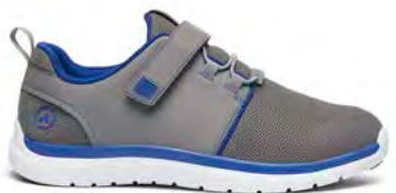
Sport Jogger Grey/Blue