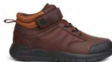
Trail Boot Whiskey