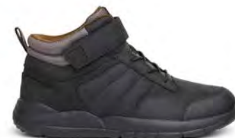
Trail Boot Oil Black