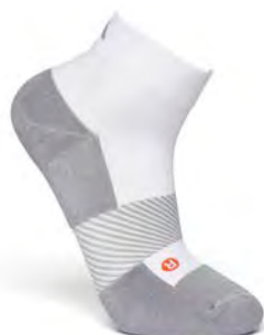
Quarter Length White