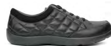
Casual Sport Black