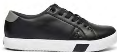
Casual Sneaker Black