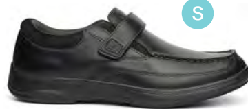
Casual Dress Black