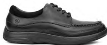
Casual Dress Black