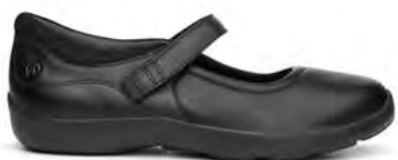
Casual Mary Jane Stretch Black Stretch