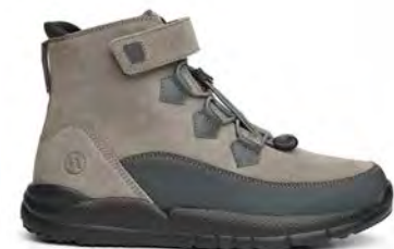
Trail Hiker Grey

The comfort you deserve. The style you desire. The support you require.