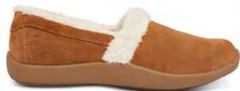
Smooth Toe Camel