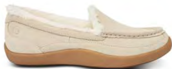
Moc Toe Sand