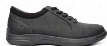
Casual Sport Oil Black