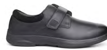
Casual Comfort Black