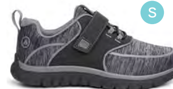
Sport Jogger Black/Grey