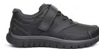
Sport Walker Black