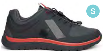
Sport Runner Black/Red