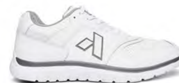
Sport Trainer White