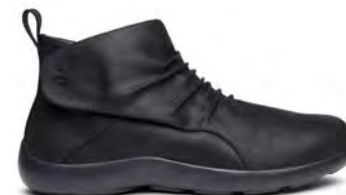
Casual Boot Black