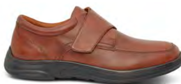
Casual Oxford Burnished Brown