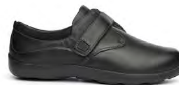
Casual Comfort Black