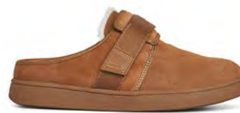
Open Back Camel