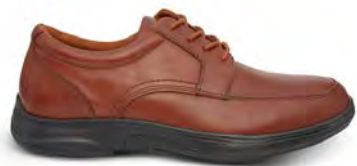
Casual Oxford Burnished Brown