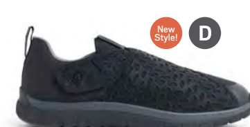
Sport Double Depth Stretch Black