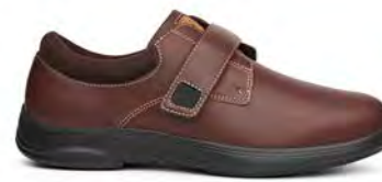
Casual Comfort Whiskey