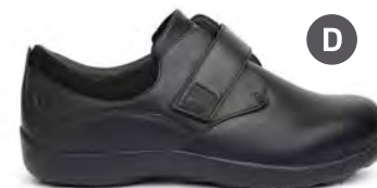
Casual Double Depth Black Stretch