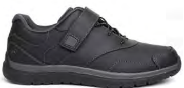
Sport Walker Black