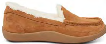
Moc Toe Camel