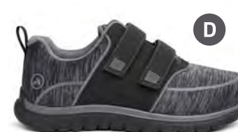
Sport Double Depth Black/Grey