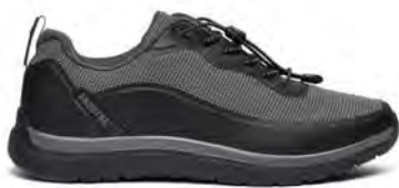
Sport Sprinter Black