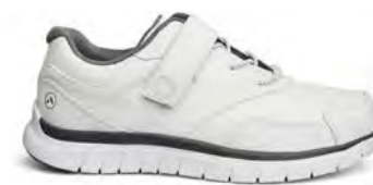
Sport Walker White