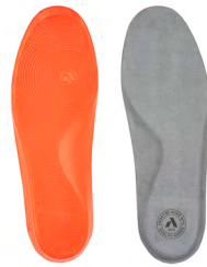
Gel-Foam Hybrid Inserts