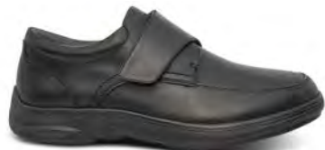
Casual Oxford Black