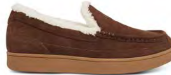
Moc Toe Espresso