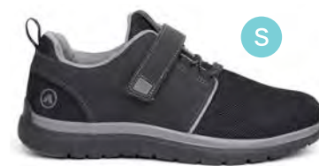
Sport Jogger Black/Grey