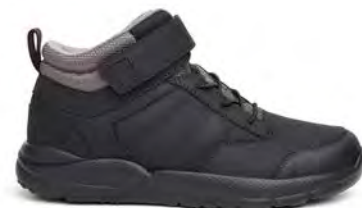
Trail Boot Oil Black