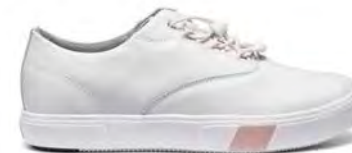
Casual Sneaker White