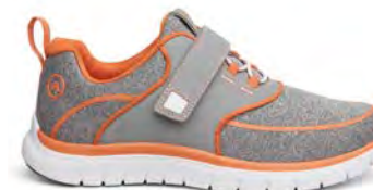
Sport Jogger Grey/Orange