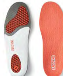
Thin Multi Density Orthotic