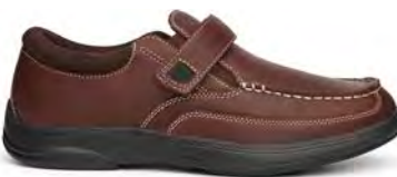
Casual Dress Whiskey