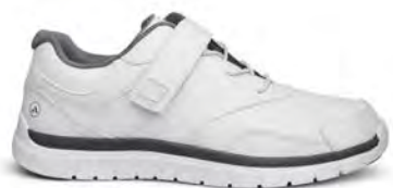
Sport Walker White