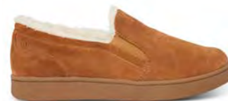
Smooth Toe Camel