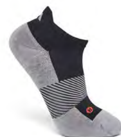
No Show Black