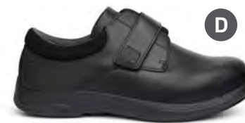
Casual Double Depth Black Stretch