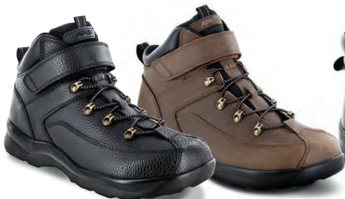
A4000M Color: Black Sizes: 7-13, 14, 15 Widths: M, W, XW Depth: 5/16"