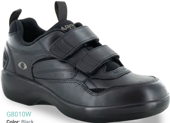
G8010W Color: Black Sizes: 4.5-11, 12, 13 Widths: M, W, XW Depth: 1/2"