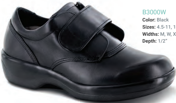
B3000W Color: Black Sizes: 4.5-11, 12, 13 Widths: M, W, XW Depth: 1/2"