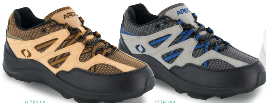
V751M Color: Brown Sizes: 6.5-13, 14, 15 Widths: M, W, XW Depth: 5/16"