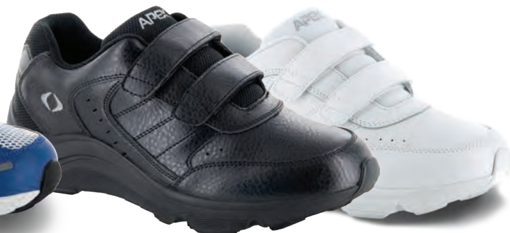
V950M Color: Black Sizes: 6.5-13, 14, 15 Widths: M, W, XW Depth: 5/16"