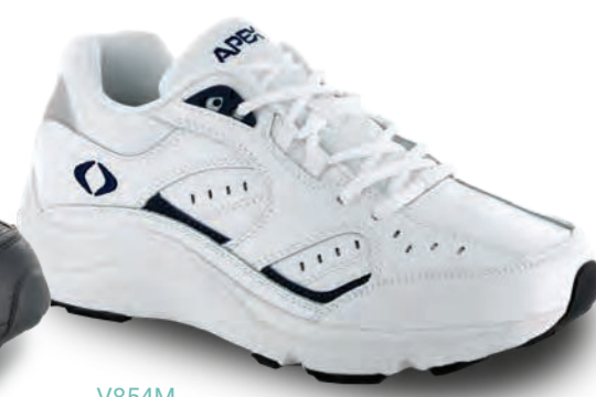
V854M Color: White/Blue Sizes: 6.5-13, 14, 15 Widths: M, W, XW Depth: 5/16"