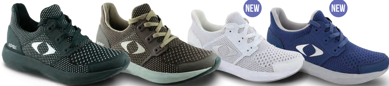
P7000M Color: Black Sizes: 7-13, 14 Widths: M, W, XW Depth: 5/16"