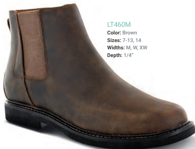
LT460M Color: Brown Sizes: 7-13, 14 Widths: M, W, XW Depth: 1/4"