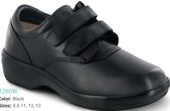
1260W Color: Black Sizes: 4.5-11, 12, 13 Widths: M, W, XW Depth: 1/2"