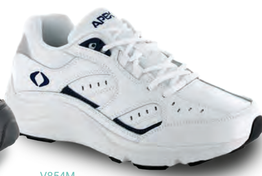
V854M Color: White/Blue Sizes: 6.5-13, 14, 15 Widths: M, W, XW Depth: 5/16"