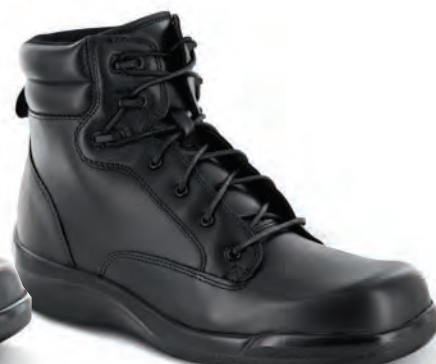
B4500M Color: Black Sizes: 6.5-13, 14, 15, 16 Widths: M, W, XW Depth: 1/2"