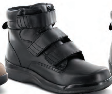
B4200M Color: Black Sizes: 6.5-13, 14, 15, 16 Widths: M, W, XW Depth: 1/2"