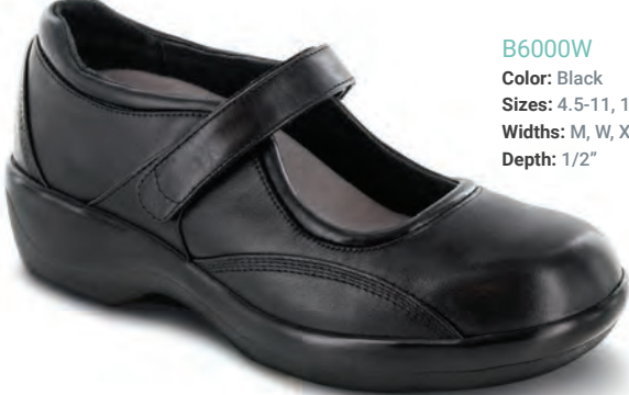
B6000W Color: Black Sizes: 4.5-11, 12, 13 Widths: M, W, XW Depth: 1/2"