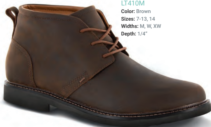
LT410M Color: Brown Sizes: 7-13, 14 Widths: M, W, XW Depth: 1/4"