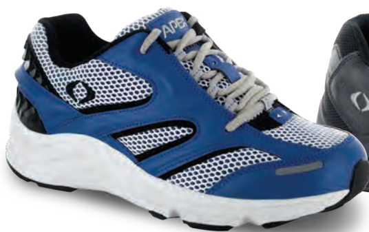
V551M Color: Blue Sizes: 6.5-13, 14, 15 Widths: M, W, XW Depth: 5/16"