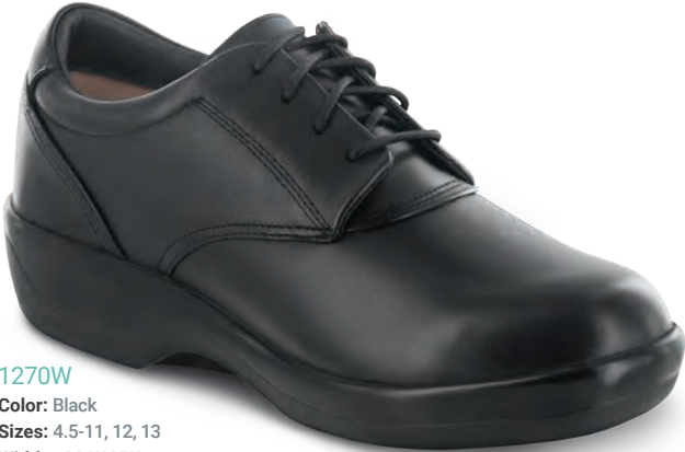
1270W Color: Black Sizes: 4.5-11, 12, 13 Widths: M, W, XW Depth: 1/2"